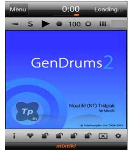
Splash Screen displayed in center

Note: The image is stretched to fill a skin-specific area which depends on the screen size/skin that Mixtikl is running at.