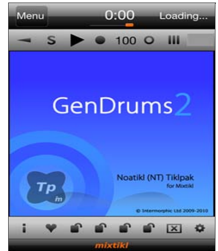
Pak Load Image displayed in center

The KEY thing to remember when making your Pak, is that your MUST zip it up correctly , with the right path structure.